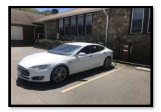
Charging your electric vehicle at Maggie Valley Town Hall is a complimentary service of the Town