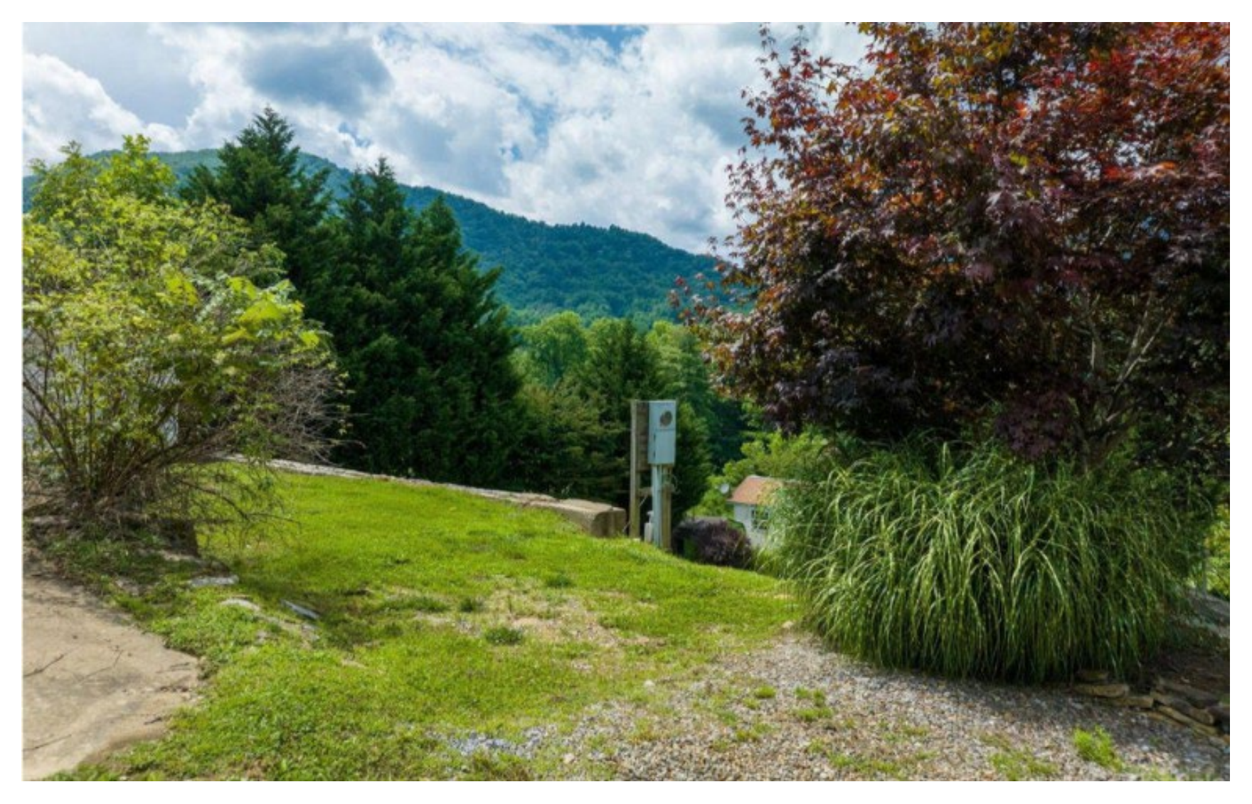
Difficult Access for ingress and egress