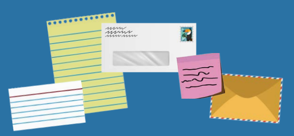
Mixed paper, office paper, glossy paper, envelopes and Post-It notes