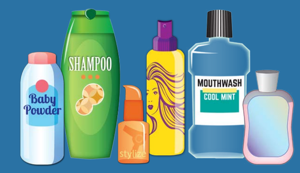
Plastic bathroom bottles (put pumps in the trash)