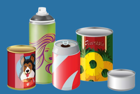
Aluminum, tin, steel cans and empty aerosol bottles