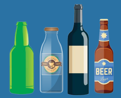
Glass beverage bottles (put lids and caps in the trash)