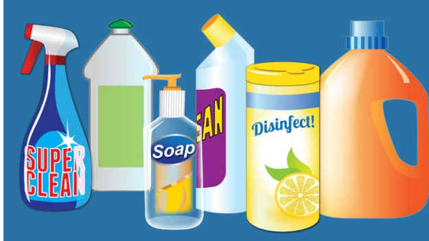
Plastic cleaning bottles and containers (put pumps in the trash)