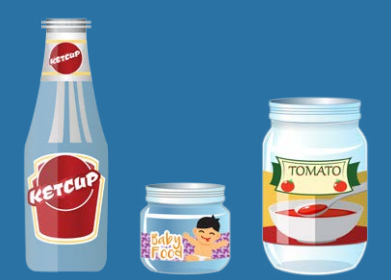
Glass food jars (put lids and caps in the trash)