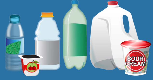
Plastic food and beverage tubs, jugs and bottles (keep lids and caps screwed on)