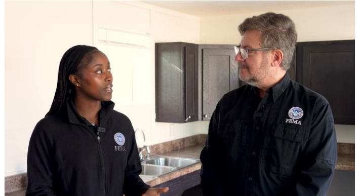
FEMA Video: Tour of the Units Available through FEMA's Direct Housing Assistance Program